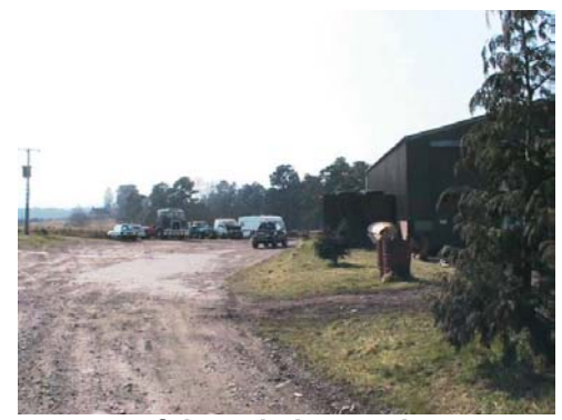
Figs. 5 and 6: Examples of the open nature of the existing yard area