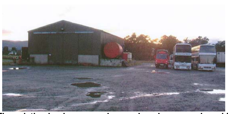
Fig. 3 : The existing business premises and yard area, as viewed from the proposed site.