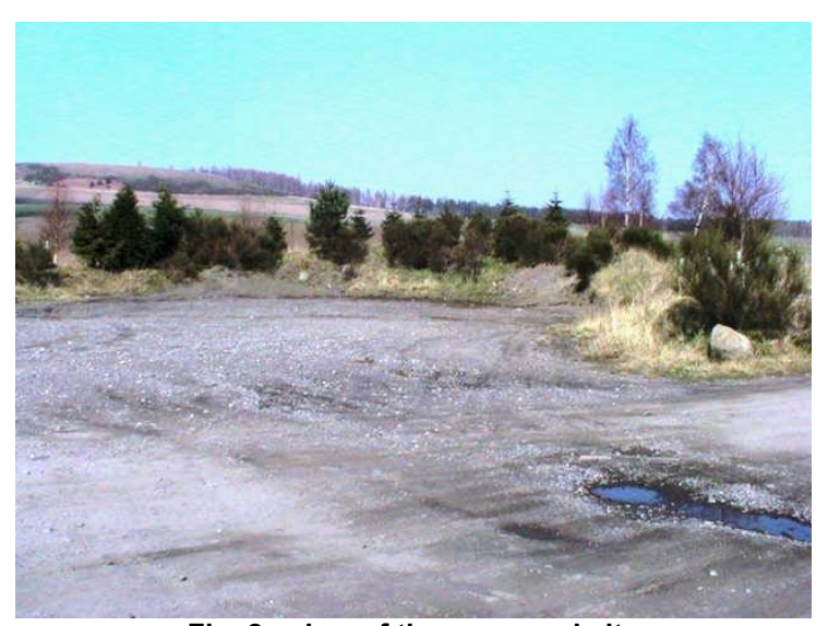
Fig. 2: view of the proposed site