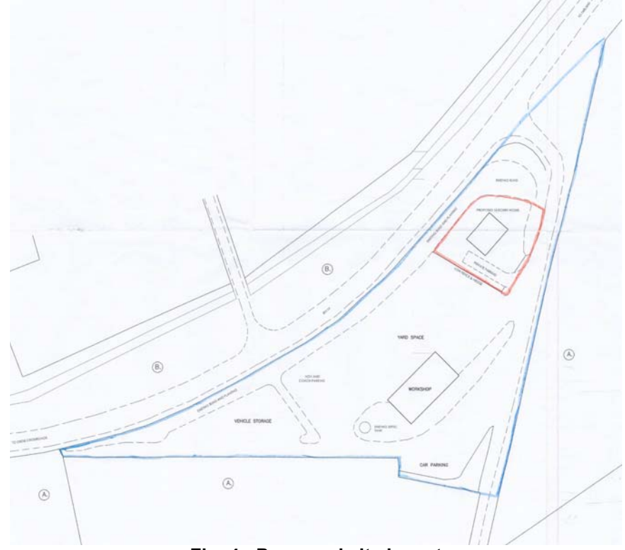
Fig. 4: Proposed site layout

3. Although an application for outline permission only, an indicative site layout plan has been submitted, showing the footprint of a house positioned in a relatively central position, on a north – south orientation. Access is proposed to be taken from the existing lane off the B9119 which serves the existing business. It is indicated that the proposed dwelling house would be a 1 ½ storey property. The site layout plan also includes provision for 'private parking' on site, and indicates that the southern boundary would be formed by a low fence and hedge. The western and northern boundaries of the proposed site are already formed by an existing bund, which accommodates some planting.